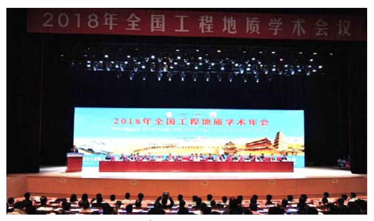
Opening Ceremony of 11th China Engineering Geology Conference

The conference called on relevant units, societies and associations to convene the national high-level forum on disaster prevention and reduction as soon as possible, to discuss the implementation of the national disaster prevention and reduction strategy. The annual engineering geologyconference is the most influential, comprehensive and high-level academic exchange platform in the field of engineering geology in China.