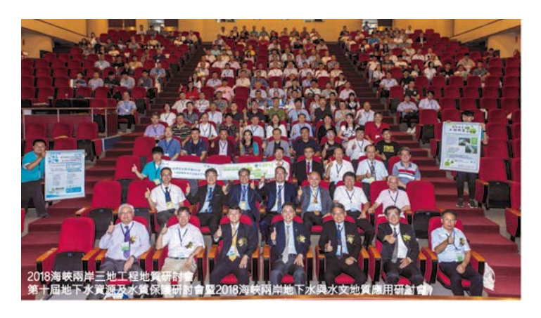
Group photos of cross strait hydrogeology conference