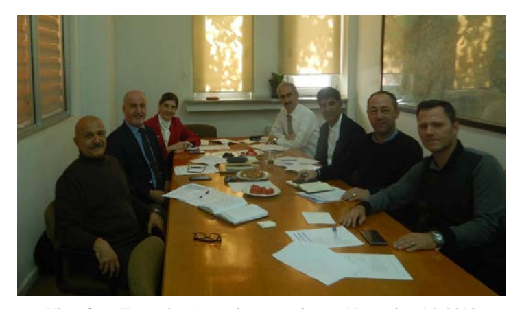
View from Executive Committee meeting on November 16, 2018

Executive committee had meetings in Istanbul Technical University on 11 June, and 16 November 2018.