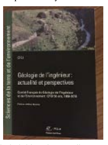
Geologie de l'ingenieur actualite et prespectives

French National Group published a book called Geologie de l'ingenieur actualite et prespectives for the occasion. There were many articles about the history of engineering geology in France and how the profession operates today.