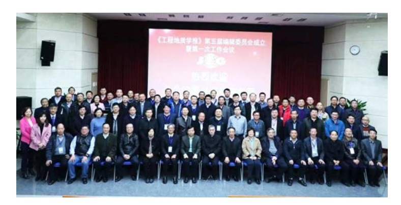
Group photo of the fifth editorial committee of the Journal of Engineering Geology