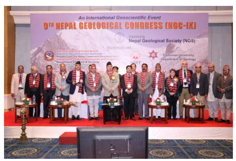
Inauguration of 9th Geological Congress (NGC-IX)